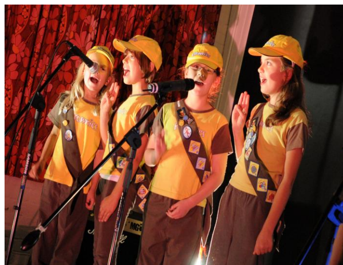
The 4 th Emsworth Brownies