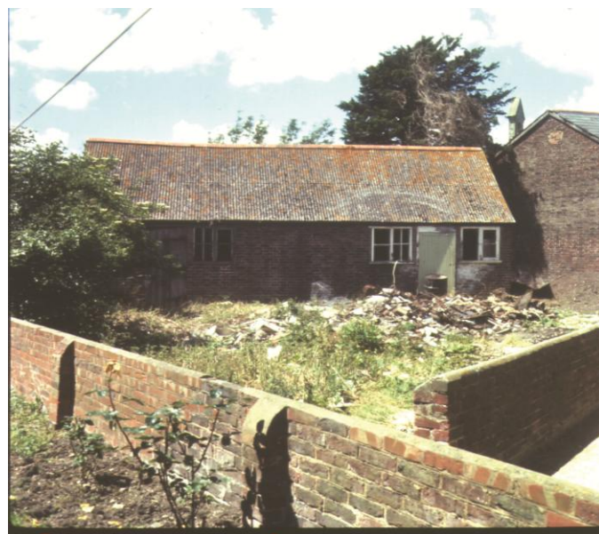
The building in 1970

Telephone 01243 375860 or e-mail cliveyeomans@talktalk.net