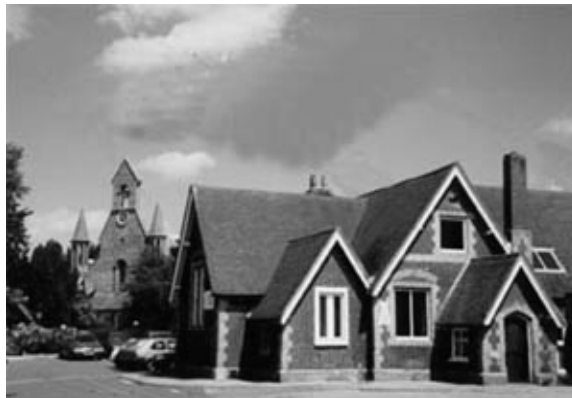
Accommodation for Your Social Event